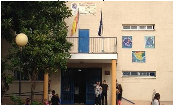
IES San Severiano (main entrance)