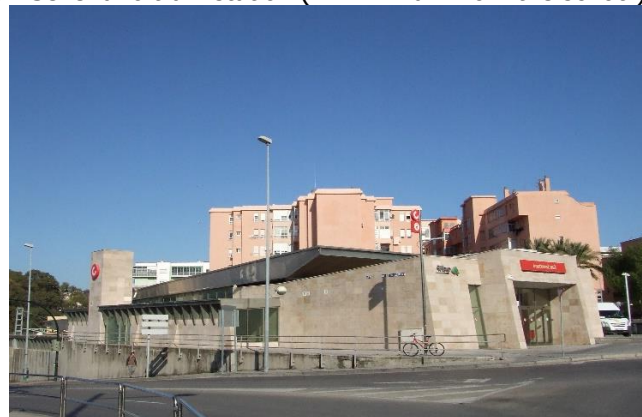
San Severiano train station (1 min. walk from the school)